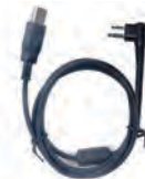
Programming Cable (USB Port) PC63