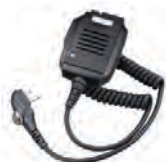
Remote Speaker Microphone (IP55) SM13M1