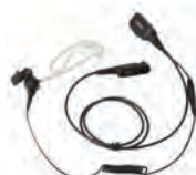
Detachable Earpiece with Transparent Acoustic Tube EHN22