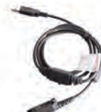
Programming Cable (USB Port) PC45