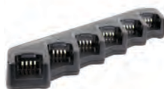
MCU Multi-Unit Charger (for Thick Battery) MCA08