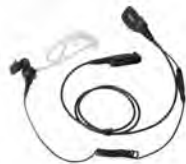
Detachable Earpiece with Transparent Acoustic Tube EHN22