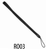
R003 Nylon Hand Strap

INCLUDED WITH THE HP702 UL913 and HP782 UL913