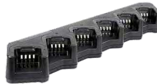
MCL32 6-Radio Multi-Unit Charger