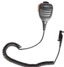
SM26N2-P UL913 Palm PTT Mic with Speaker and emergency button (IP54)