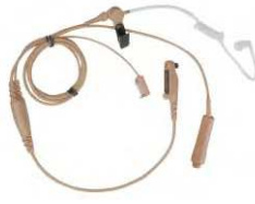
EAN21-P UL913 3-wire Surveillance Earpiece with Transparent Acoustic Tube