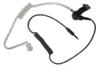
ES-02 Receive-Only Transparent Acoustic Tube