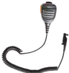
SM26N1-P UL913 Palm PTT Mic with Speaker and emergency button (IP67)

Remote Speaker Mics provide easy access for audio, are water resistant, and attach directly to the radio.