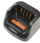
CH10L27 Drop-In Single Unit Charger