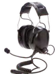
ECN21-P UL913 Noise-Cancelling Headset with PTT and boom microphone