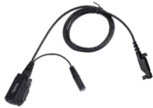
ACN-02-P UL913 Mic and PTT button with VOX and 3.5mm Jack Receive-only Earpiece (IP54)

External earpieces that are used in combination with the ACN-02-P