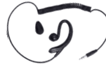
EH-01 Receive-Only C-Style Earloop