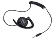
EH-02 Receive-Only Swivel Earpiece