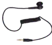
ES-01 Receive-Only Earbud