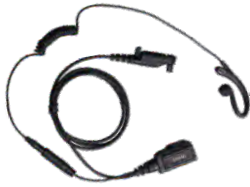
EHN26-P UL913 C-style Earpiece with microphone and in-line PTT button

External earpieces and microphones that attach directly to the radio