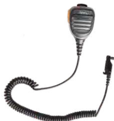
SM26N2-P UL913 Palm PTT Mic with Speaker and emergency button (IP54)